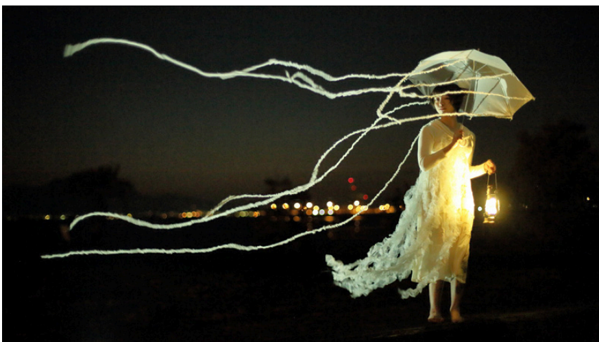
Still image from Tomoki Okamatsu's A Dark Night Jellyfish (2015)