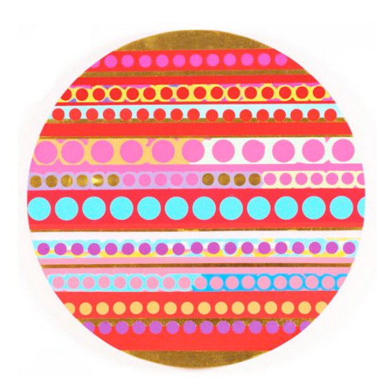
Hyunjoo Park "MA-UM" gesso, acrylic, gold leaf on panel 60×60cm 2009