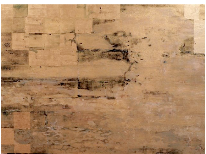
Masako Yasuki "exposed scape – a collective memory" glue, pigment, Paris white, gold leaf on wooden panel, hemp cloth and Bolognese chalk 100×140cm 2010