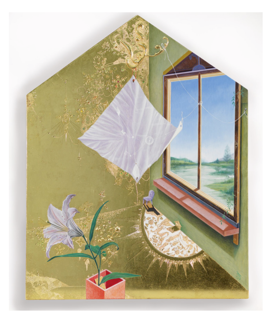
Jungduk Song "Space for Reminiscence" tempera, gold leaf on panel 16.2×20.7cm