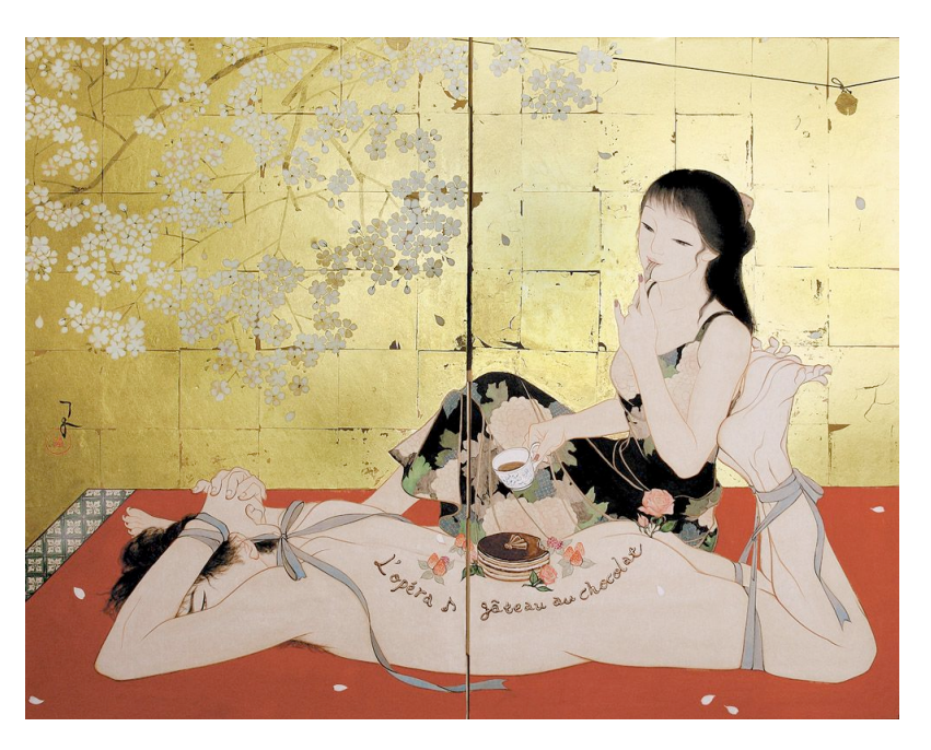
Ryoko Kimura "Dessert / A man's body dish for L'opera gateau au chocolat" Japanese pigment, gold leaf on paper (standing screen) 120×97cm 2005