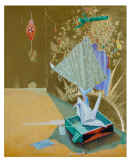
Jungduk Song "Space for Reminiscence" tempera, gold leaf on panel 19×22.5cm