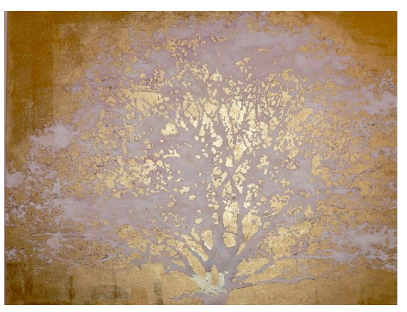
Masako Yasuki "exposed scape – a childhood tree" glue, pigment, Paris white, gold leaf on wooden panel, hemp cloth and Bolognese chalk 68×90cm 2010