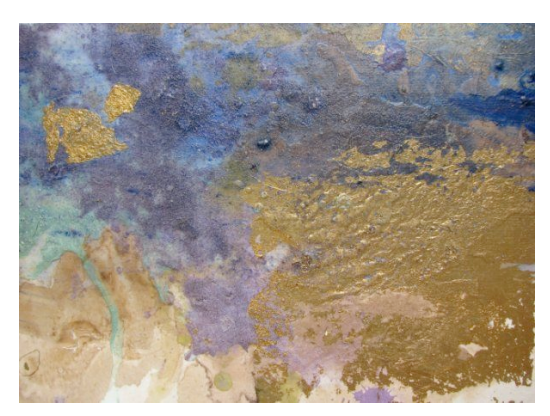
Chion Lee "Whenever it may be, we shall meet again" acrylic, enamel pigment, gold leaf on canvas 19×24cm 2003