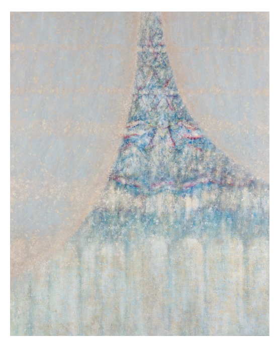
Noriyori Shirakawa "V - C - Light -2010" chalk, silver leaf, tempera, oil on canvas 100 \times 80.3 cm 2010