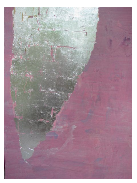
Chion Lee "Whenever it may be, we shall meet again" acrylic, pearl pigment, binder, silver leaf on canvas 130.3×97cm 2007