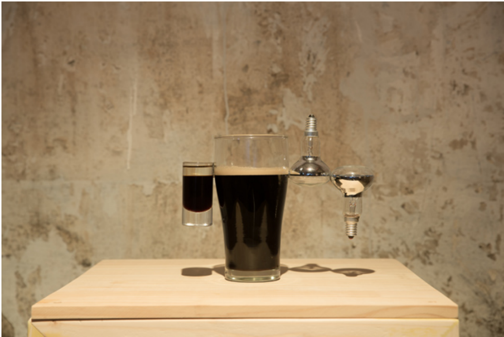
There Is No Reason

resin, urethane, rope, clothesline 25x15x25cm 2018