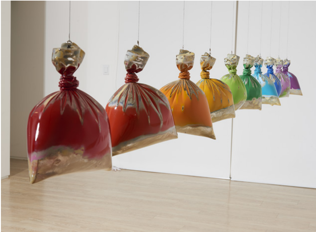
Artactually - Anti-fly Waterbag

resin, urethane, rope, clothesline 25x15x25cm 2018