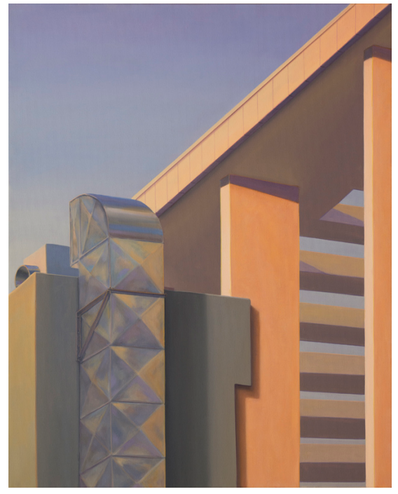
Ingo Baumgartenuntitledoil on canvas100x80cm2019

Ingo Baumgartenuntitledoil on canvas70x50cm2024