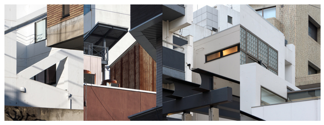
Takashi SuzukiFictum cp-0262archival pigment print44.5x121cm2018