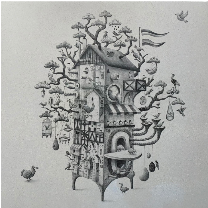
Grand Illustrated Book of Birds and Birdhouses of the World mixed media on canvas 90x90cm 2024