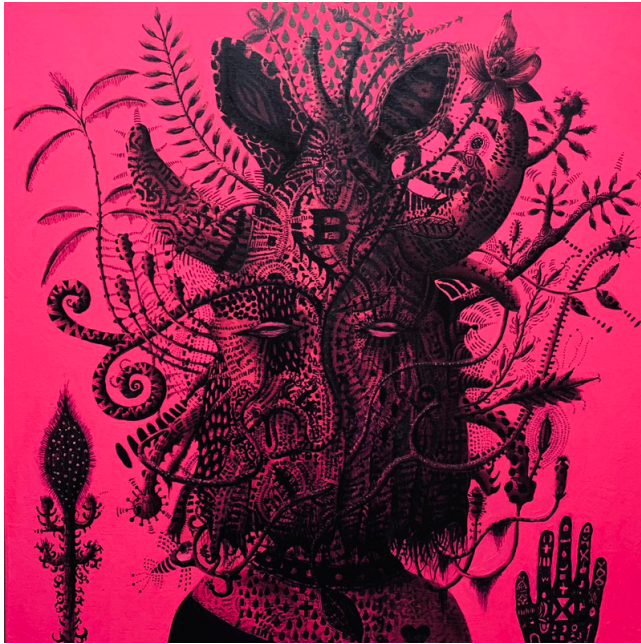
COVID-19 Zero Gravity Plant Mask mixed media on canvas 45x45cm 2024