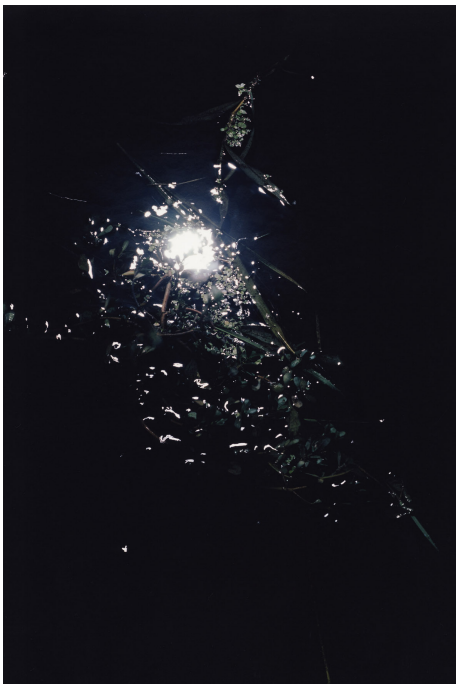
suns-54 C-print 50×35cm Ed.5 2012