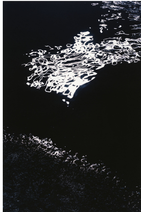
suns-73 C-print 50×35cm Ed.5 2012