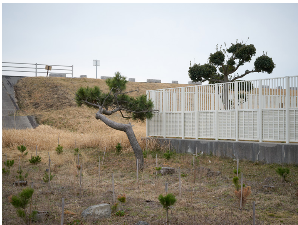
shelterbelt motoyoshiwara 2017