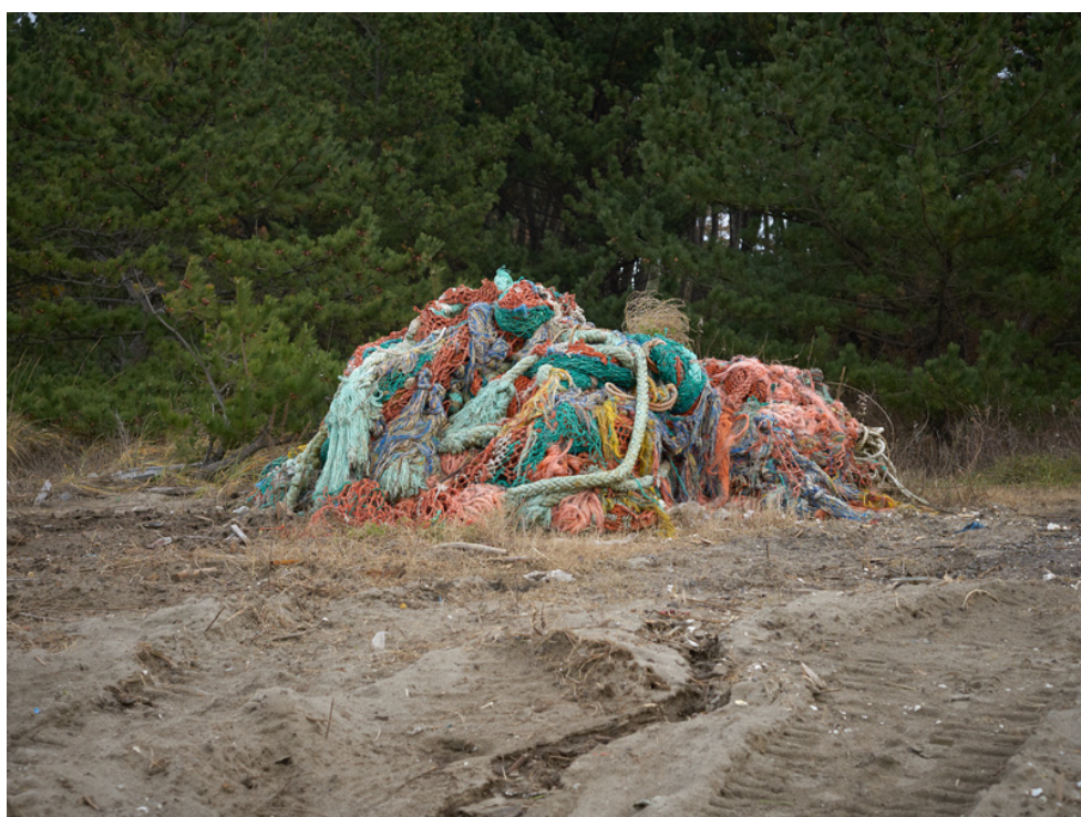
shelterbelt kisakata 2019