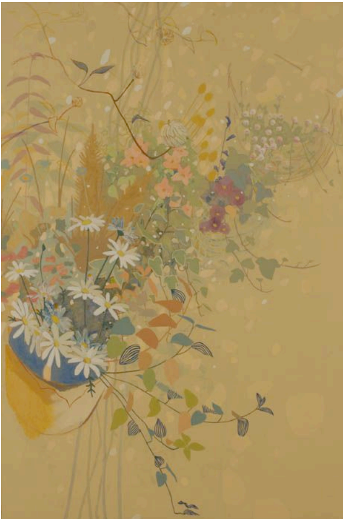
GARDEN-21 oil on canvas 145.5x97cm 2009