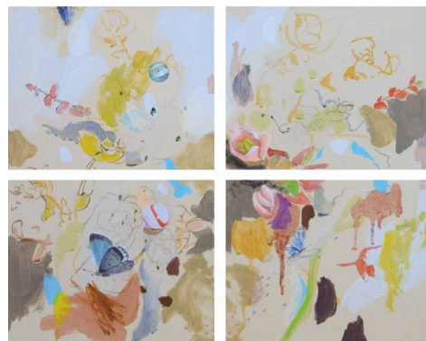
Things n.01-09 oil on canvas 22x27.3cm (set of 4 pieces) 2009