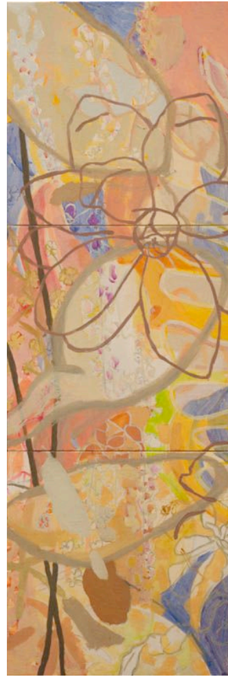
GARDEN-22 oil on panel 30x30cm (set of 3 pieces) 2009