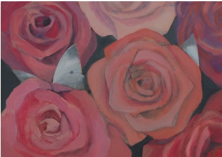
Yuna Ogino p-291016_2 oil on canvas 18.2x22cm 2016