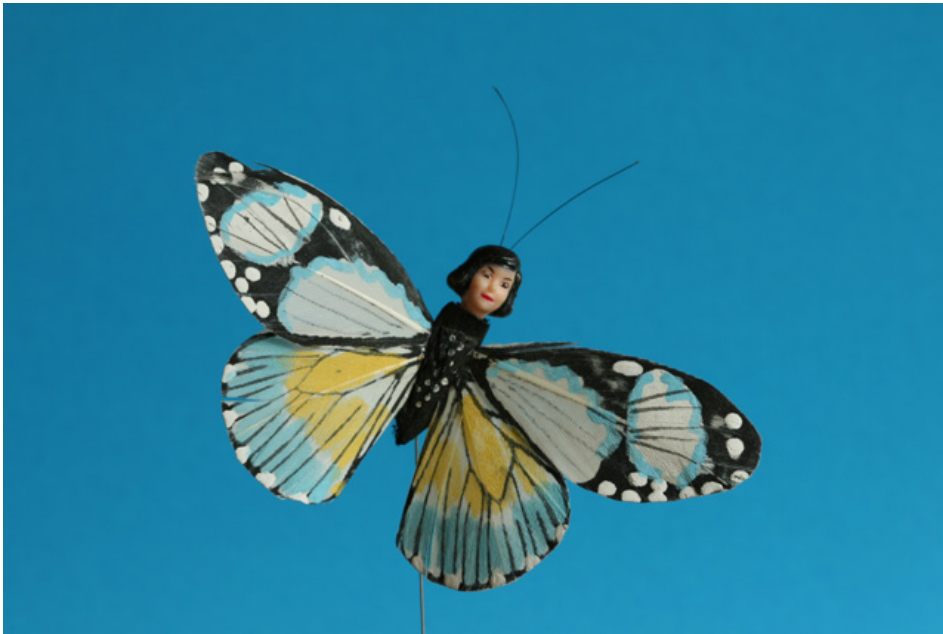
Miwako Iga Butterfly (Blue) C-print 20x30cm