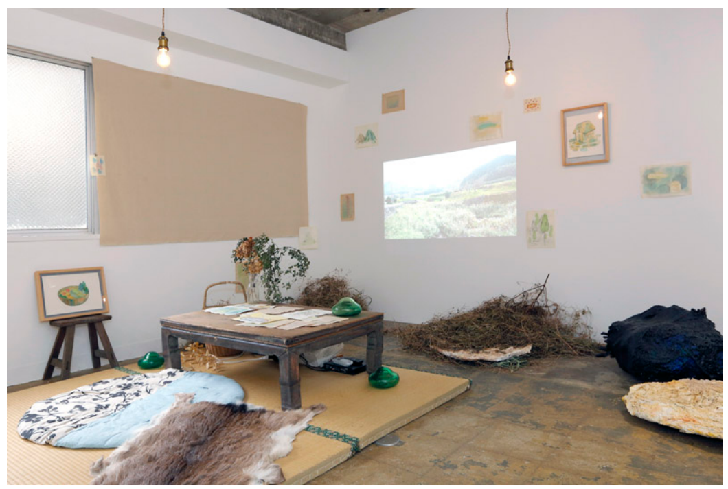
Moe Amano Kuru-kuru picnic and screen installation (photo from "Seeds in Autumn 2019 - the Era of Flower Song - I'm Here," Eureka, Fukuoka, 2019)