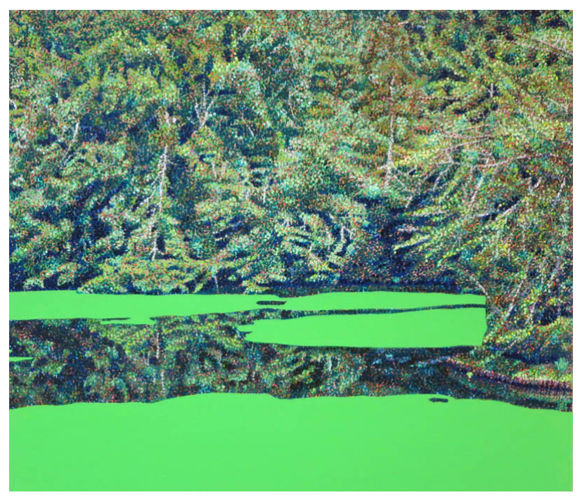
Nao Sano A Summer Day oil, acrylic on panel and linen 45.5x53cm 2020