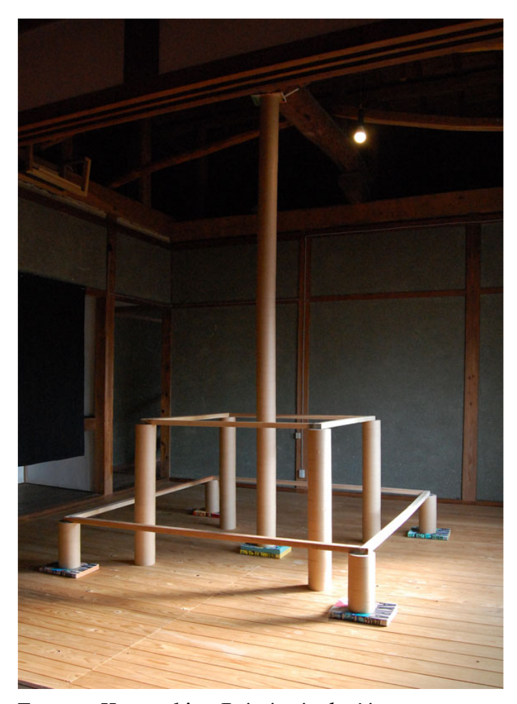
Tsutomu Haraguchi Painting in the Air packing tape, wood, books 120x120x300cm 2020