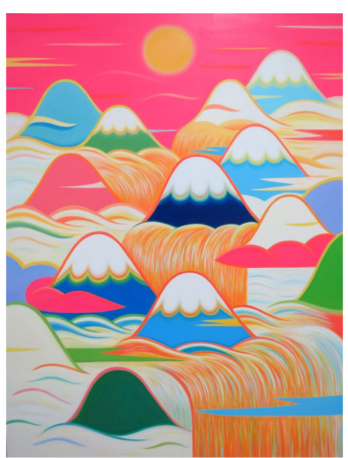
Kaori Tanaka Moon, Mountain, Water and Cloud Sea No. 2020.12 oil on canvas 145.5x112cm 2020