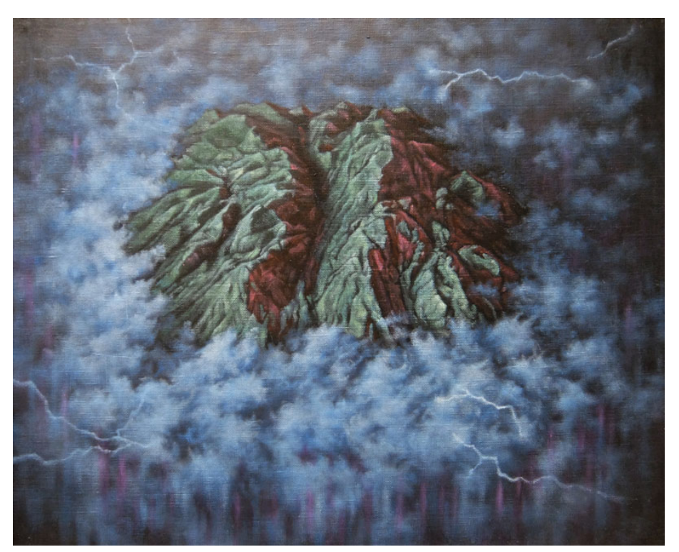
Hirotsugu Ueno Above the Clouds oil on canvas 38x45.5cm 2020