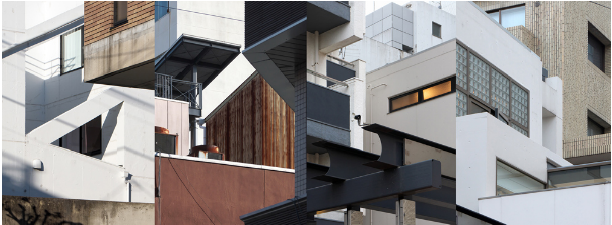
Takashi Suzuki Fictum cp-0262 archival pigment print 44.5x121cm 2018