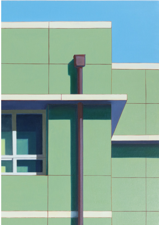
Ingo Baumgarten untitled oil on canvas 70x50cm 2024