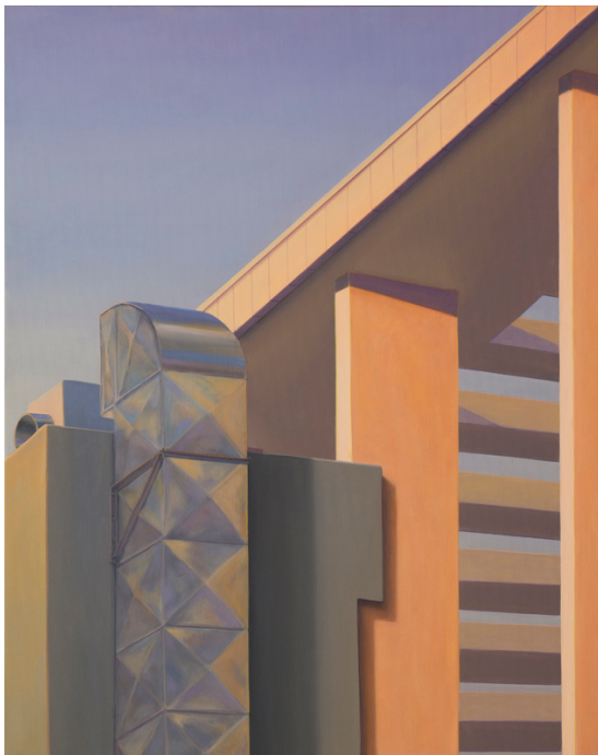
Ingo Baumgarten untitled oil on canvas 100x80cm 2019