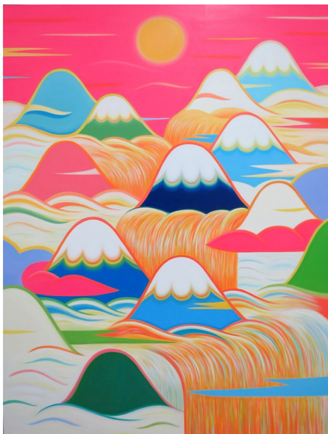
Kaori Tanaka Moon, Mountain, Water and Cloud Sea No.2020.12

oil, acrylic on panel and linen 45.5x53cm 2020