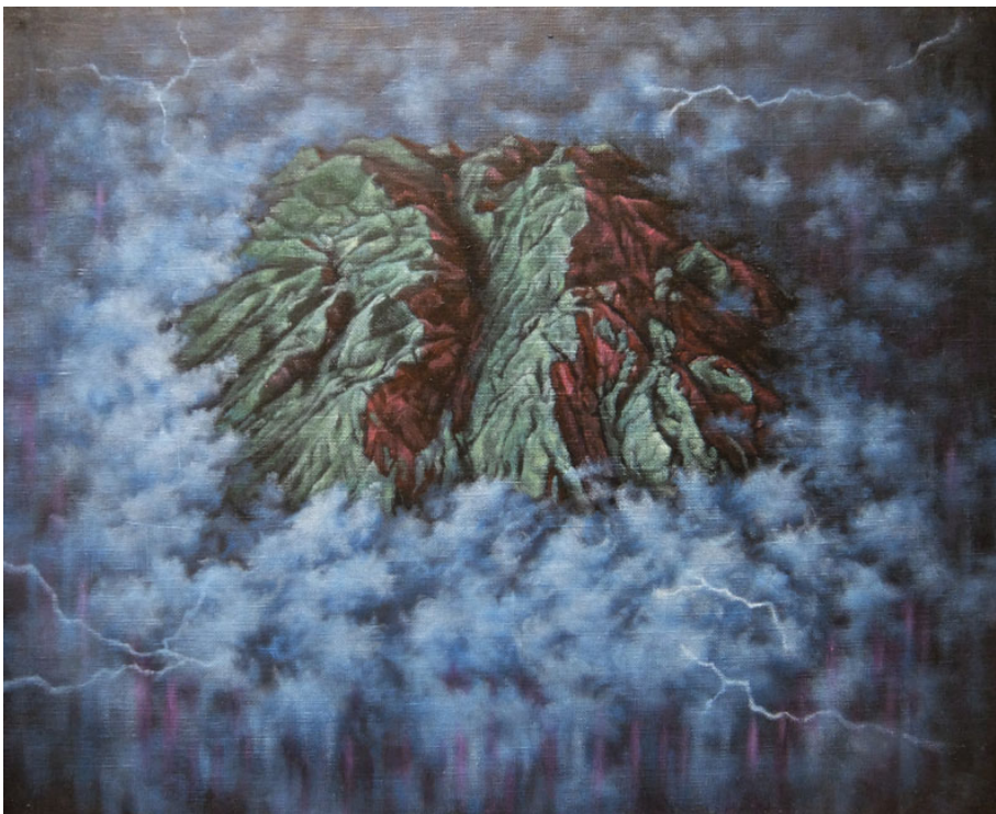
Hirotsugu Ueno Above the Clouds

installation (photo from "Seeds in Autumn 2019 - the Era of Flower Song - I'm Here," Eureka, Fukuoka, 2019)