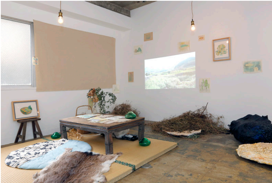
Moe Amano Kuru-kuru picnic and screen

installation (photo from "Seeds in Autumn 2019 - the Era of Flower Song - I'm Here," Eureka, Fukuoka, 2019)