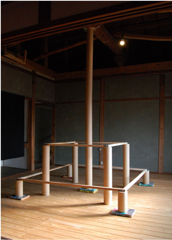
Tsutomu Haraguchi Painting in the Air packing tape, wood, books 120x120x300cm 2020